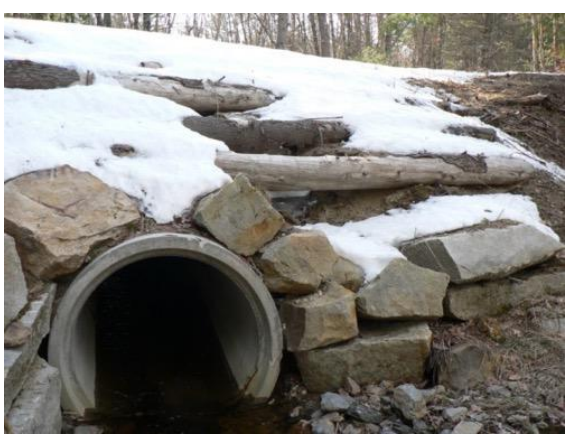
Figure 1: Erosion above culvert No. 42.37 east of Harbor Village

5.5.2. The washed out area above culvert No. 43.89, on the north side of the trail east of Shepherd's in Townsend, shall be repaired by filling with approximately 16 tons of processed gravel or crushed stone and covered with erosion control stone. Any known internal channels shall also be filled.