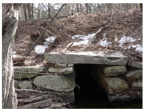
Figure 2: Washed out area above culvert No. 43.89 east of Shepherd's in Townsend

5.5.2. The washed out area above culvert No. 43.89, on the north side of the trail east of Shepherd's in Townsend, shall be repaired by filling with approximately 16 tons of processed gravel or crushed stone and covered with erosion control stone. Any known internal channels shall also be filled.