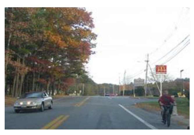
A common sight in Townsend on Route 119 now.