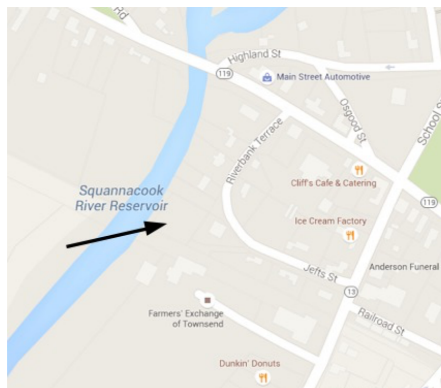
Meet at 11 am on Saturday June 11, 2016 at the town parking lot on Jefts St/Riverbank Terrace.

We will meet at 11 am on Saturday June 11th at the town parking lot in the middle of Jefts St and Riverbank Terrace (the parking lot by the trestle). There car pools will be informally organized to drive everyone to the other end of the rail trail at the Bertozzi Wildlife Area just past Crosswinds Drive in Groton. From there, we will walk the length of the rail trail back to Townsend center.