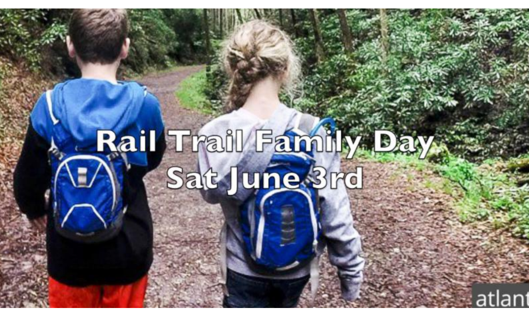
Click the image above to watch a one minute video about the Rail Trail Family Day.