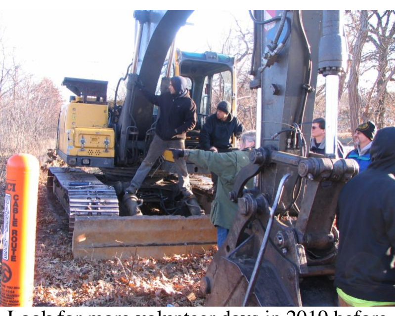
Look for more volunteer days in 2019 before planned construction begins in November!

After we complete the permitting process, we will need lots of volunteers! First, we'll need help clearing brush and trees from the rail corridor-a big job! Next, we'll install erosion control barriers to protect the resource areas. We'll use straw-filled tubes known as "wattles" that we'll stake down in designated areas. So keep an eye out for more events coming before construction begins in November 2019.