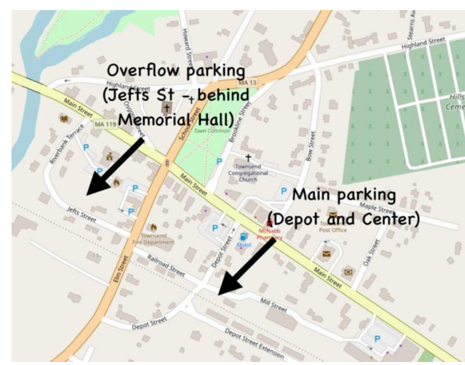
Park at the beginning of the rail trail in Townsend center

Three churches in Townsend center and Squannacook Greenways are co-sponsoring an ecumenical Earth Day clean up of the rail trail on Saturday April 27, 2019. Please come at 9:30 am to the corner of Depot and Common St (overflow parking behind Memorial Hall off Jefts St.). After an ecumenical opening prayer, we will walk and clean together from there to Harbor Church (1.8 miles). We will follow the Squannacook River Rail Trail, planned for construction this fall. Trash bags and transportation back to the beginning will be provided. Please bring gloves and bug spray. The entire family is welcome! We will be done by about 11, so there will still be plenty of time to attend Earth Day on the Common. Co-sponsored by Townsend Congregational Church, St. John the Evangelist Church, New Beginnings United Methodist Church, and Squannacook Greenways. Everyone, church member or not, is welcome!