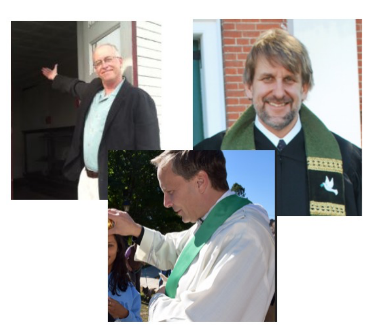
Co-sponsored by Townsend Congregational Church, St. John the Evangelist Church, New Beginnings United Methodist Church, and Squannacook Greenways