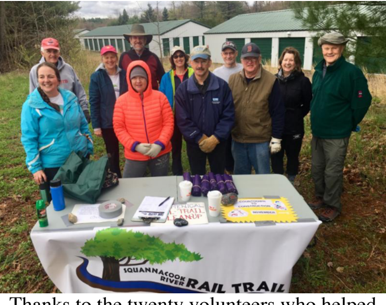
Thanks to the twenty volunteers who helped clean up the rail trail on Earth Day.

As we approach trail construction, we will need lots of volunteers! First, we'll need help clearing brush and trees from the rail corridor-a big job! Next, we'll install erosion control barriers to protect the resource areas. We'll use straw-filled tubes known as "wattles" that we'll stake down in designated areas. So keep an eye out for more events coming before construction begins in November 2019.