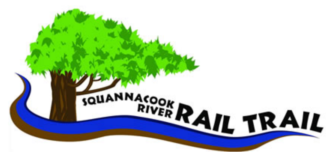
Built and maintained by Squannacook Greenways, Inc.