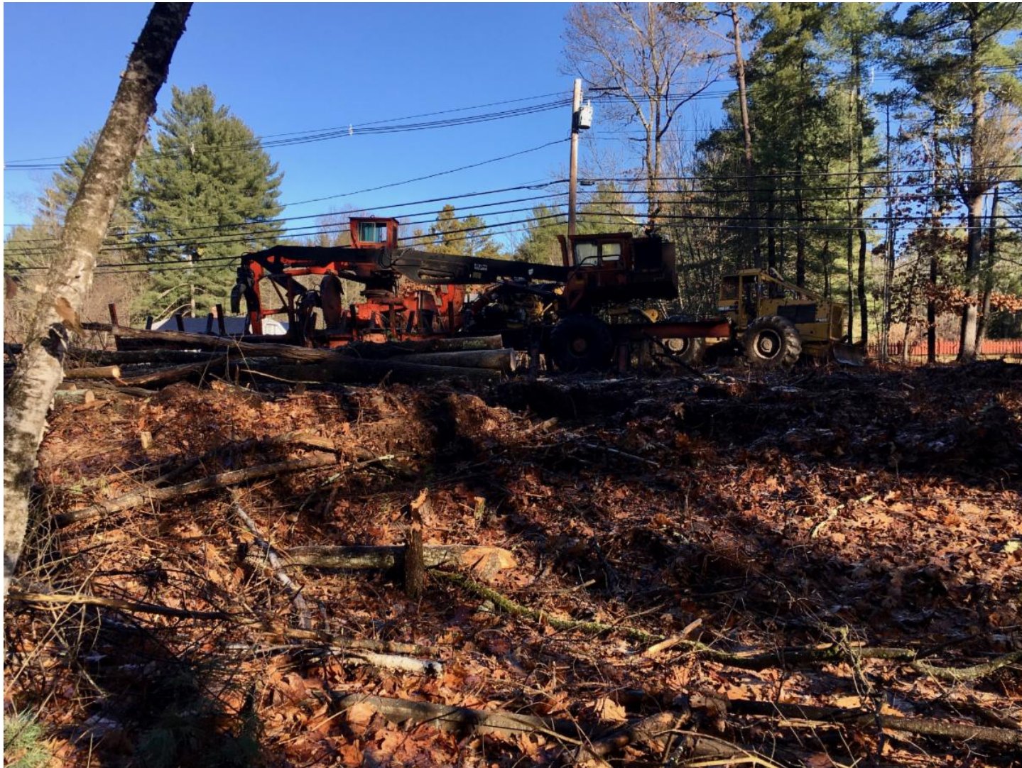
This years goal - clear all trees from the rail trail