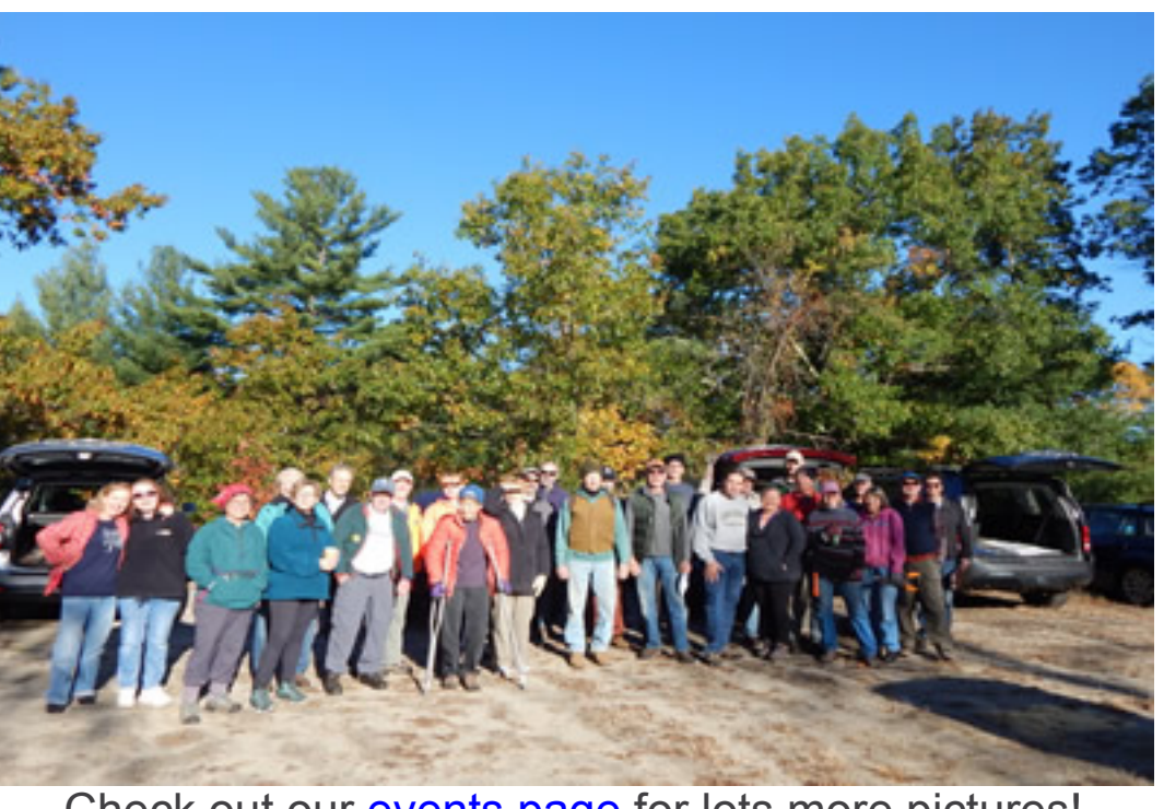
Check out our <u>events page</u> for lots more pictures!

We were overwhelmed at the great turnout for our two volunteer days Oct. 19th and Nov. 2nd. Check out our events page for lots of pictures! The turnout really made us all feel that all the years working on this project has been well worth it.