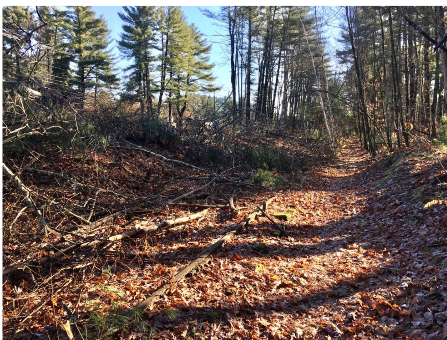
For those of you who walk the trail, please keep a safe distance from any work area.

The past month has been a amazing one for everyone involved with this rail trail. First, we had two extraordinary volunteer days on Oct 19th and Nov 2nd, where over 80 volunteers showed up and did great work installing over a mile of wattles. Then, on Nov. 20th, construction began with the contractor who started clearing the rail trail of trees. They will eventually clear the entire planned rail trail of trees before the construction window closes March 15th.