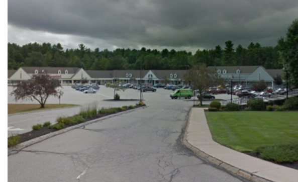
Everyone at Harbor Village has been a great help to us in building this rail trail

Our thanks to Harbor Village for all their cooperation in allowing us to access the rail trail for construction from the rear of their mall. Special thanks to Rite Aid, the Wine Nook, and the Wireless Zone (Verizon) for their help in moving their dumpsters to allow the construction vehicles room to enter. Please thank them for helping to make this rail trail possible when you stop by!