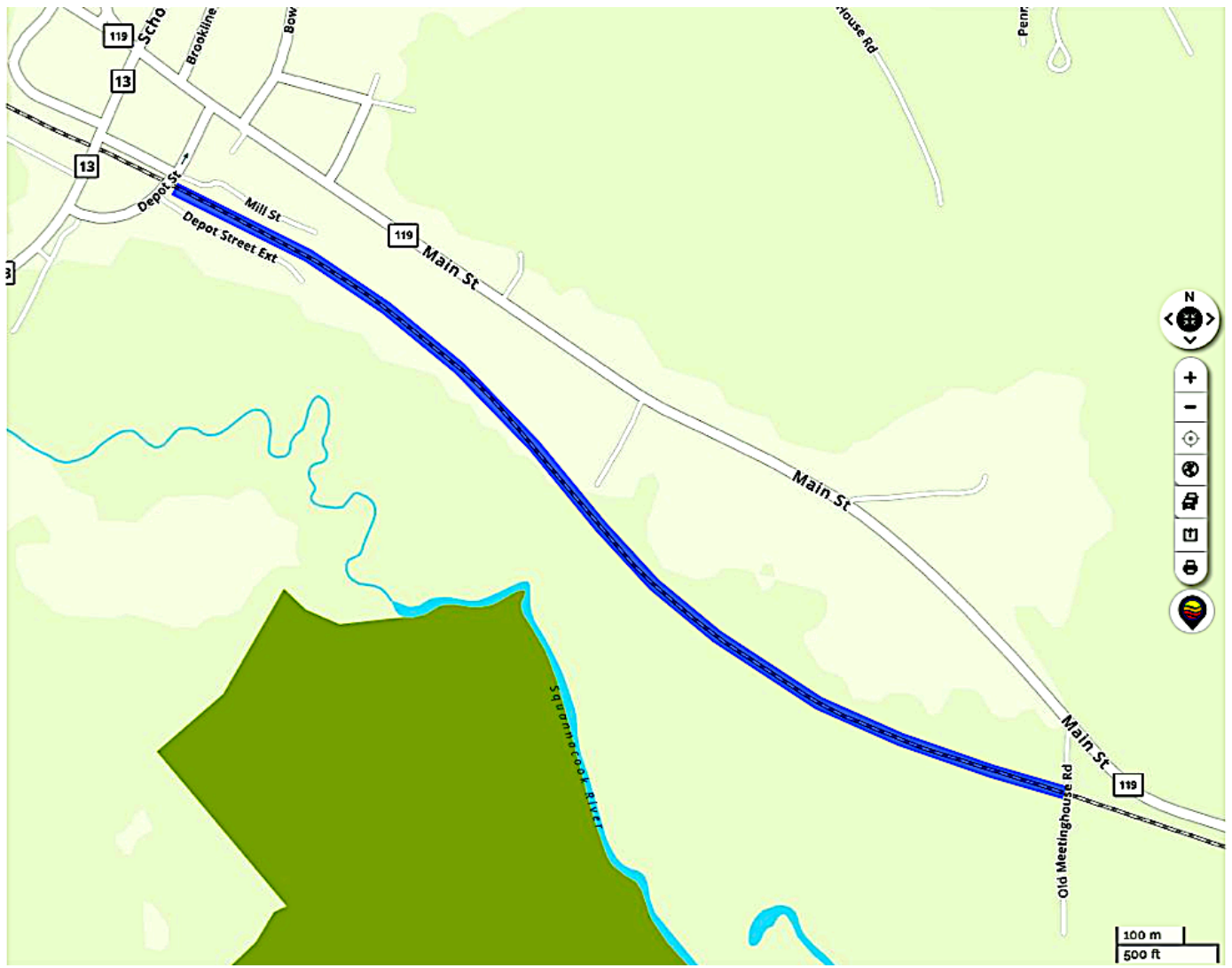
With this grant we will be able to complete the rail trail from Depot St to Old Meetinghouse Road in Townsend, a distance of 1.1 miles.

Squannacook Greenways is excited to announce that we were awarded a $100,000 grant to help finish the first part of our rail trail, from Depot St to Old Meetinghouse Road in Townsend. With this money and some of our previously raised funds, we will be removing the rails and ties, and putting down a 10 foot wide stone dust surface in this 1.1 mile section.