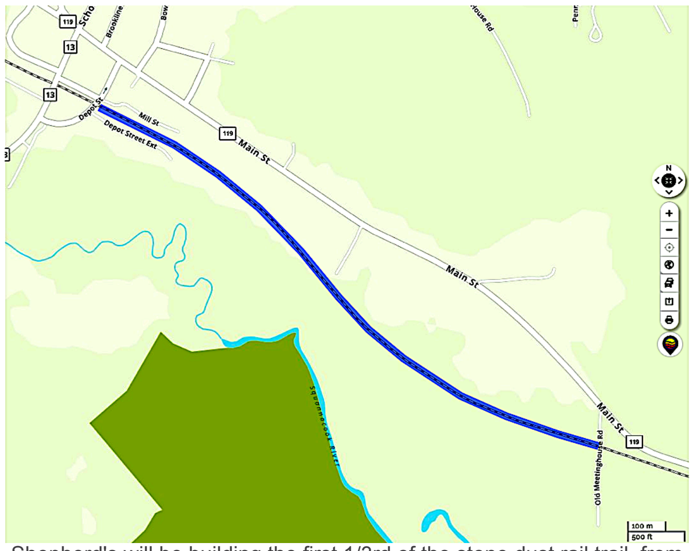
Shepherd's will be building the first 1/3rd of the stone dust rail trail, from Depot St to Old Meetinghouse Road in Townsend, a distance of 1.1 miles.

This fall and winter we will be building the first 1/3rd of the Squannacook River Rail Trail, from Depot Street in Townsend center, to Old Meetinghouse Road. The rails and ties will be removed, and a stone dust surface suitable for all bicycles will be applied. In addition, a 12 vehicle gravel parking area will be installed at Depot St/Center St in Townsend center.