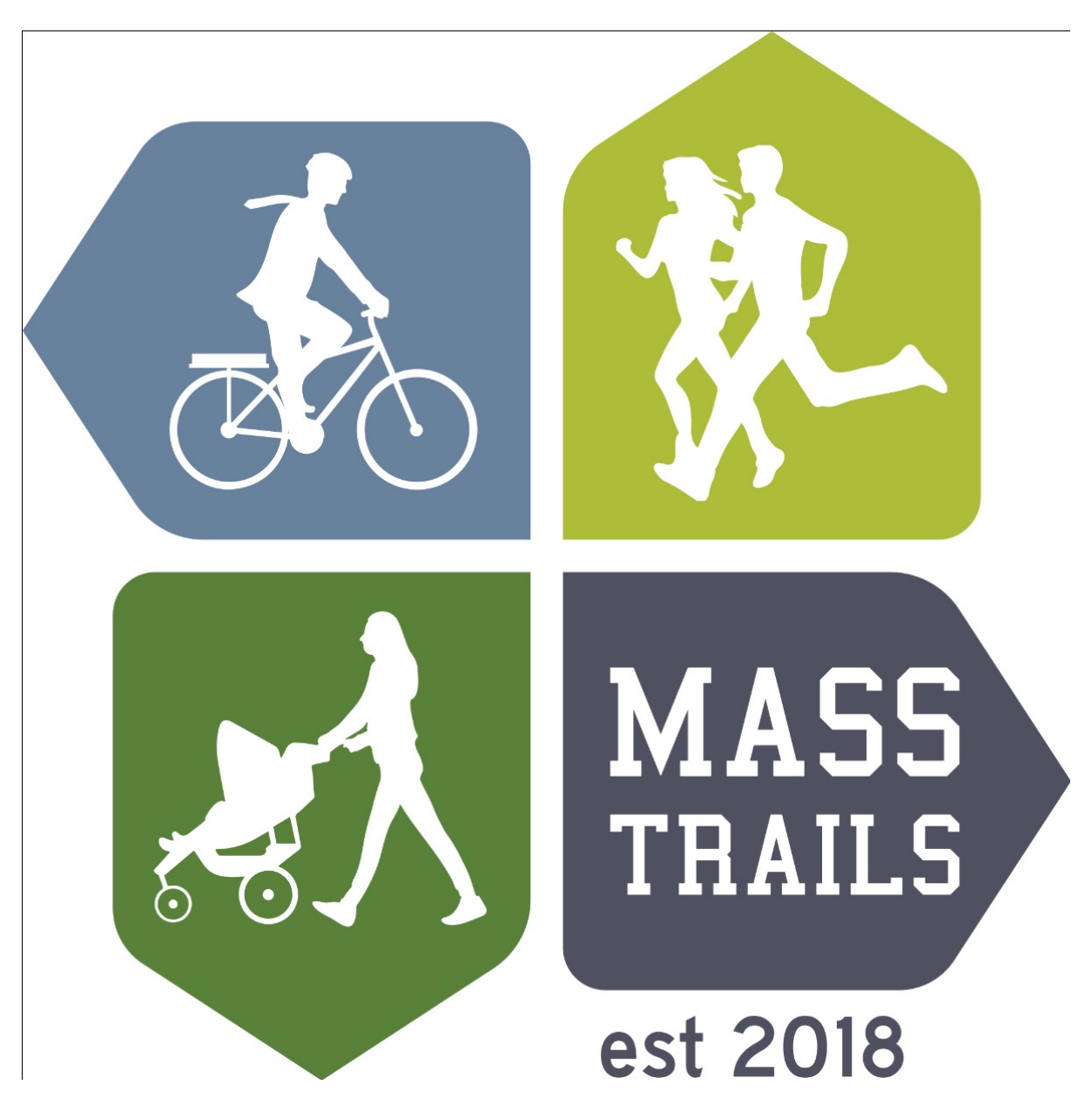
Thanks to MassTrails for numerous grants that helped make this rail trail possible.