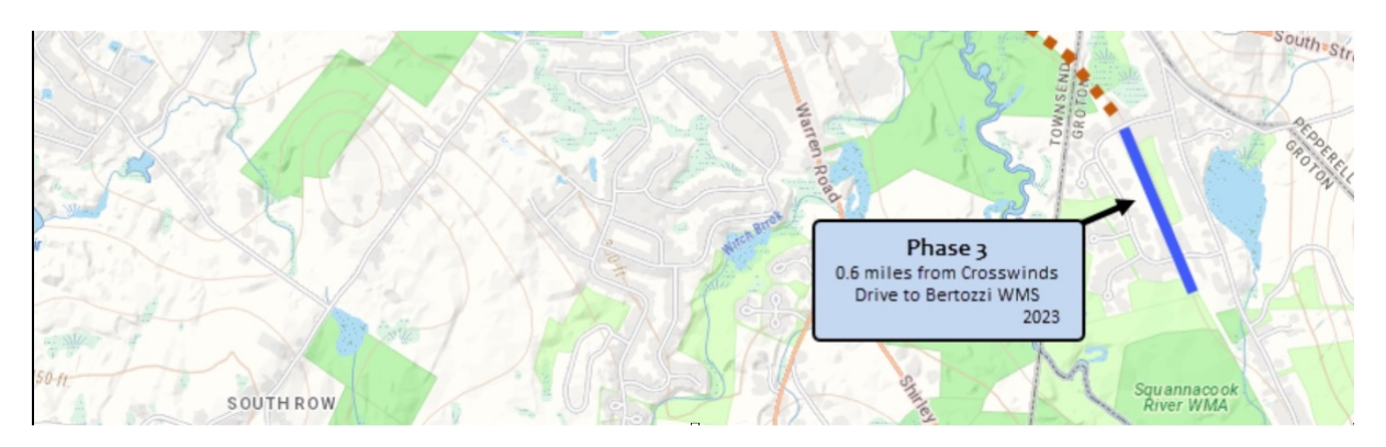
The four phases of the presently planned Squannacook River Rail Trail.